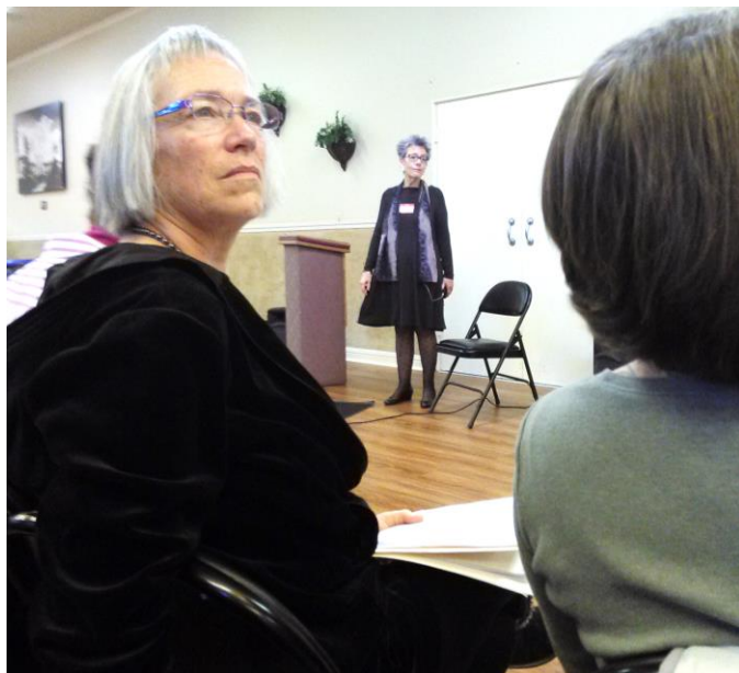
CHERYL TAKES A QUESTION FROM AN ATTENDEE

Include your full name. Myron Walters will confirm your RECAMFT membership and admit you. We are now 127 strong.