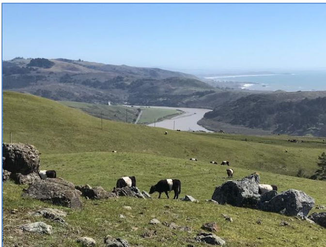
This was taken at Jenner Headlands Regional Park showing the view down the coast which includes the Russian River. Lovely loop for a day hike.