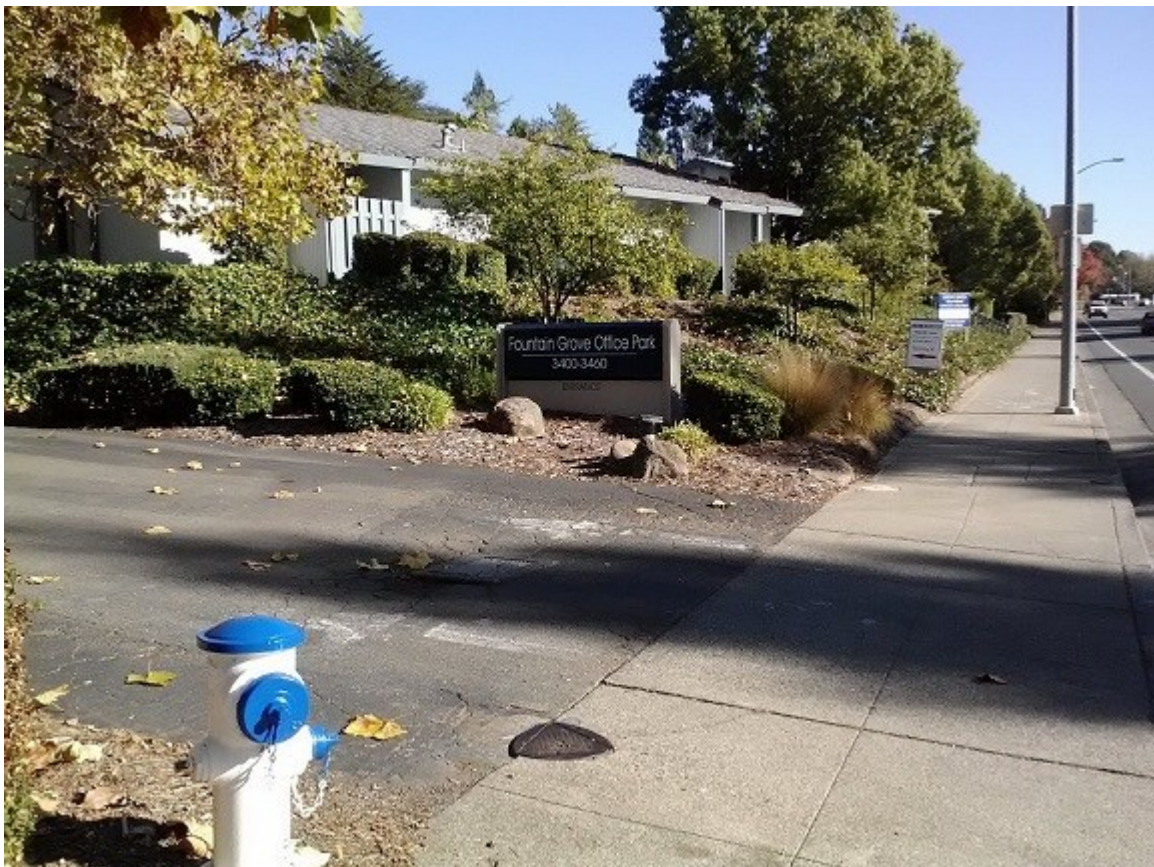
Below: The entry driveway looking south on Mendocino Ave.