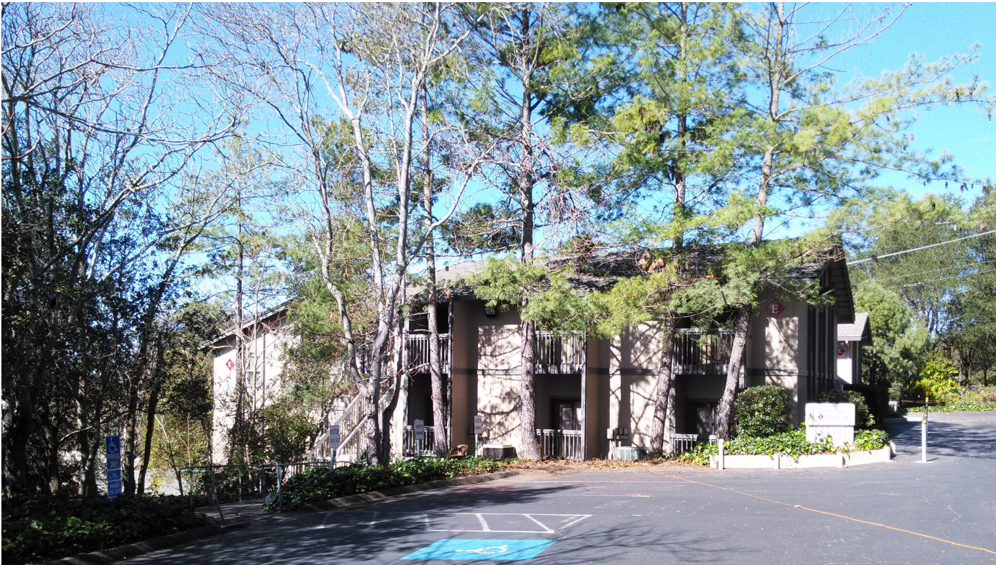
Above: Building E in the upper left corner of the complex. Lots of free parking in the complex.