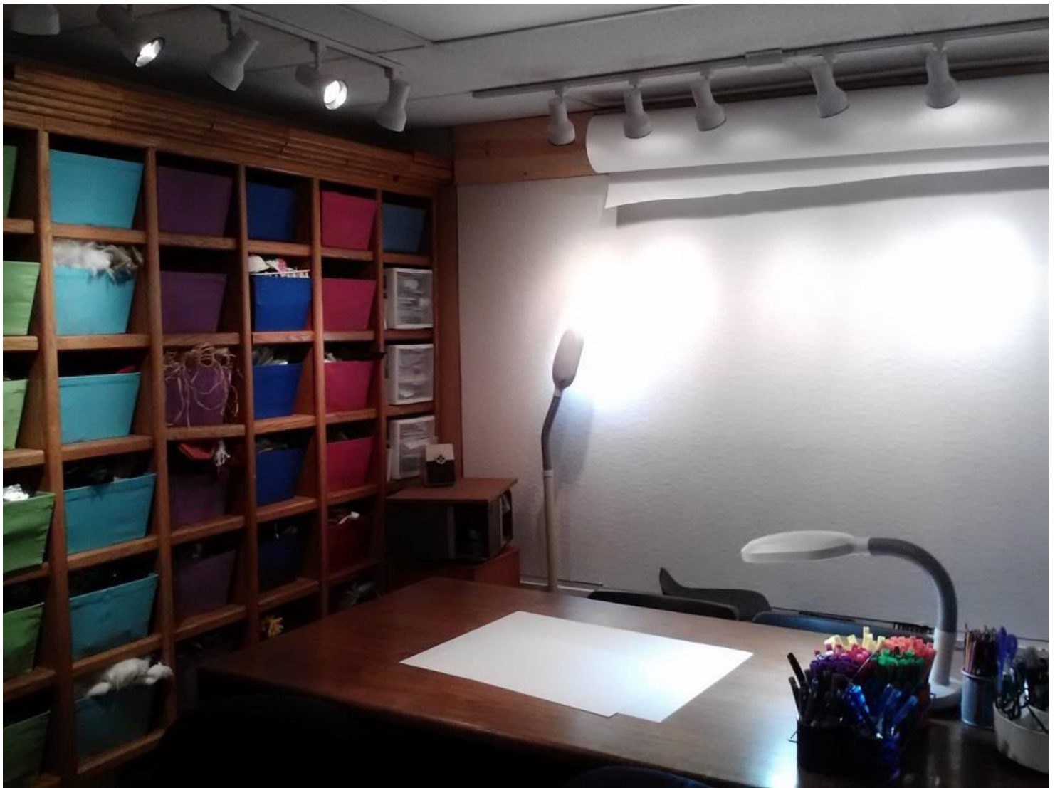
The large Art Therapy Room also has room for small groups or families not shown here.